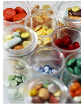
Did you know it's a felony to allow others to take your prescription drugs?

Pill mills, uncontrolled prescription drug use, and mixing substances leads to death. These are just a few of the serious death and legal problems related to substance abuse today.